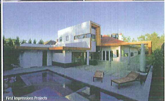
First Impressions Projects